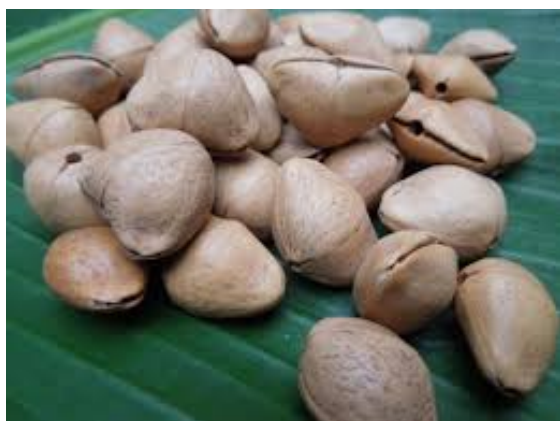
Figure 1: Yellow Oleander ( Thevetia peruviana ) Seeds

Government Villupuram Medical College is a tertiary care center which caters to the health needs of a population of approximately three million. The study center is based at a rural district in Southern India, the prime occupation of the feeder population being agriculture. The majority belongs to the lower socioeconomic strata with low literacy rates. Nevertheless, most of them are aware that all parts of the plant are poisonous and tend to select the seeds for their high toxicity. Oleander plants are plentiful in availability round the year. For obvious reasons oleander-poisoning cases are encountered very frequently at our center, however standard management or monitoring protocols are far from satisfactory. Data on the incidence, clinical features and the determinants of mortality are scanty. The study aimed to identify key mortality predictors in oleander poisoning, document the clinical spectrum of patients presenting with oleander poisoning and to devise a standard assessment protocol in oleander poisoned patients.